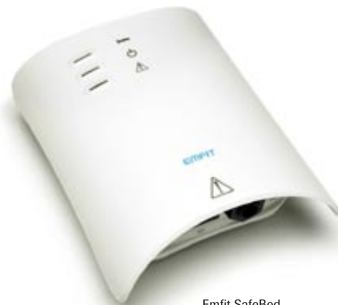
Emfit SafeBed Bed-Occupancy Monitor D-1070-2G

In the summer 2008 released 2nd generation monitor is now operated with 2 pcs AA size 1,5 V batteries. An optional, medical grade AC adapter is also available.