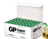
AAA Pager Batteries (x40) BAT-AAA