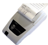
Thermal Printer PRN-T