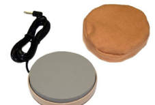
Pillow Switch S64-PWSH