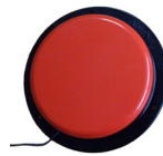
Big Red Button S64-JBS