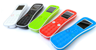
DECT Handset PK-BDH