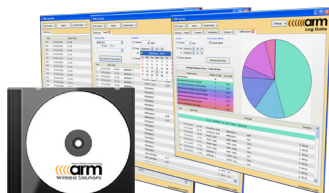
Call Logging Software S64-SWI

All events are time and date stamped for future reference either using a printer or PC software. The PC software is fully searchable and allows Management Reports to be viewed easily and printed/exported if required.