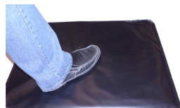
Pressure Mat S64-PRM