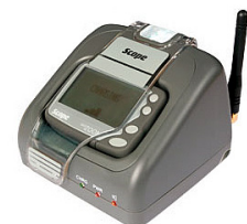
Standard Charging Unit (for Zoom Pagers) S64-ZM-CHG