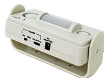
Movement Sensor S64-PIR-KIT