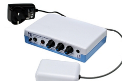
Epilepsy Sensor S64-EP1