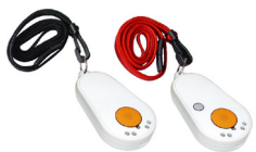
IR Fob - (rechargeable)

Infra Red or Radio Personal Alarm units can be incorporated into the system for remote signalling by service users or staff/lone workers. These portable alarm units are available in various styles: