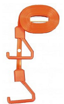
Anti-ligature Cord S64-ALPC