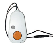
Neck Pendant (rechargeable) (2008 systems onwards)

BeltClip & Neck Pendant are available in different versions: (1) Infra Red only, (2) Radio only or (3) Combined Infra Red & Red version. Please contact us for more information.