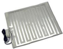
Moisture Sensor S64-EN1

To enhance your arm Nurse Call system 'Assistive Technology' devices can be plugged into the socket of the Nurse Call unit, which will provide automated monitoring & alerting via the Nurse Call system.