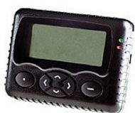
Waterproof Pager MT-WPP

Make the most out of your system by adding Pagers or DECT phones for members of Staff on the move. Handle calls promptly with Nurse Call messaging direct to Staff.