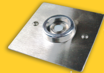
Anti-Ligature standard Call Push