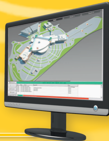
Pop-up window for your PCs along with full graphical displays

Wide range of call/reset units including jack sockets for patients who need pendants