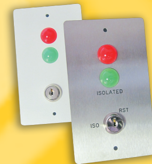
Key reset with isolation facility and integral over-door light

Typically used outside rooms and as follow-me lights in corridors